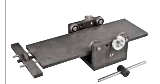
Peel & Friction